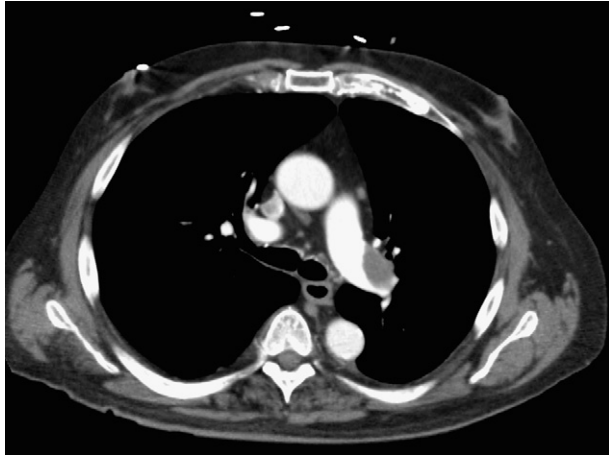
Figure 1. Representative example of computed tomographic angiogram demonstrating >90% stenosis of distal left main pulmonary artery by acute PE.

radiologic findings were performed by radiologists not participating in the study. To be eligible for enrollment, the patients were required to have a minimum of \geq 2 new signs and symptoms consisting of chest pain, tachypnea (respiratory rate at rest \geq 22 breaths/min), tachycardia (heart rate at rest \geq 90 beats/min), dyspnea, cough, oxygen desaturation (oxygen partial pressure < 95\% ) or elevated jugular venous pressure \geq 12 cm H 2 O. RV enlargement or hypokinesia and elevation of biomarkers of RV injury (troponin I and brain natriuretic peptide), although measured, were not a requirement for enrollment. The exclusion criteria included an onset of symptoms > 10 days; > 8 hours since the start of parenteral anticoagulation; systemic arterial systolic blood pressure < 95 or \geq 200/100 mm Hg; eligibility for full-dose thrombolysis; a contraindication to unfractionated or low-molecular-weight heparin; severe thrombocytopenia (platelet count < 50,000/\text{mm}^3 ); major bleeding within < 2 months requiring transfusion; surgery or major trauma within < 2 weeks; brain mass; neurologic surgery, intracerebral hemorrhage, or subdural hematoma within < 1 year; end-stage illness with no plan for PE treatment; and an inability to perform echocardiography because of chest deformities, bandages, or catheters.